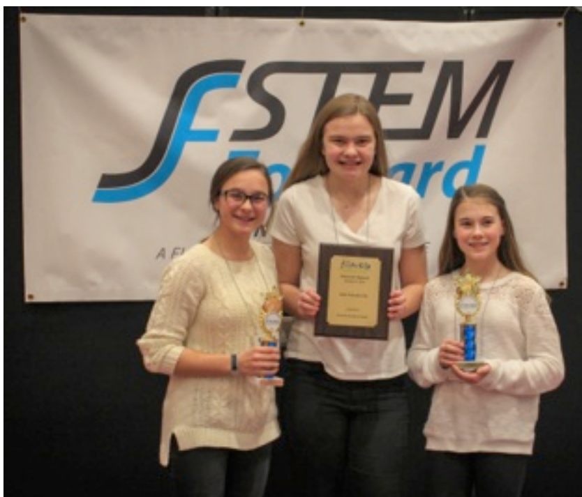
The team winning “Most Futuristic” City!!!