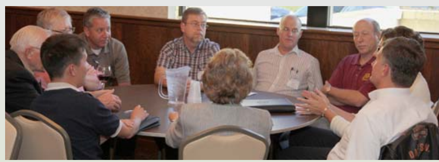
ROUNDTABLE DISCUSSION GROUP