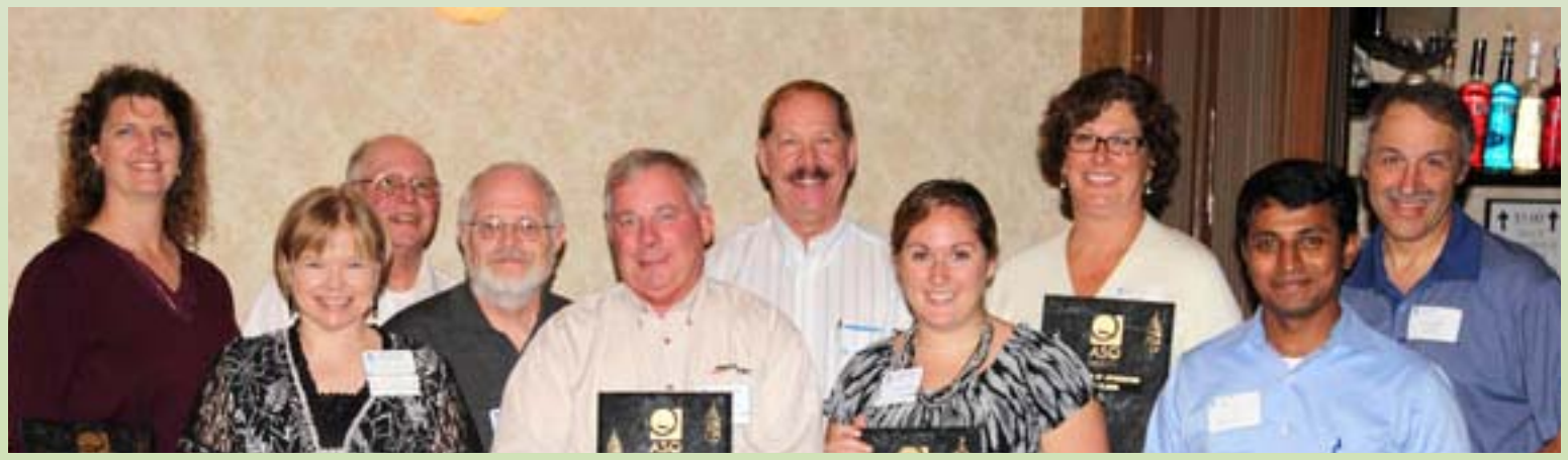
LEADERSHIP TEAM SERVICE AWARDS