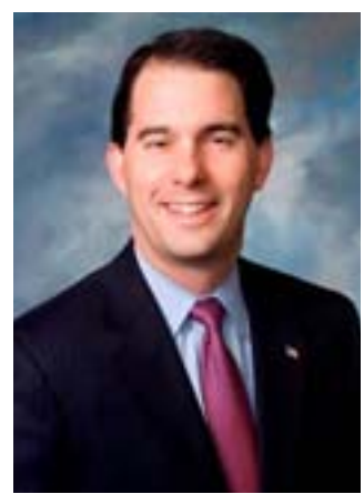
Governor Scott Walker

As everyone is acutely aware, the state of the US economy is not robust. Recent press reports and news casts are alarming and perhaps depressing. The US debt rating has been downgraded. Job growth has been non existent and unemployment is hovering just under 10%. Home foreclosures are still a common occurrence and some banks are still distressed.