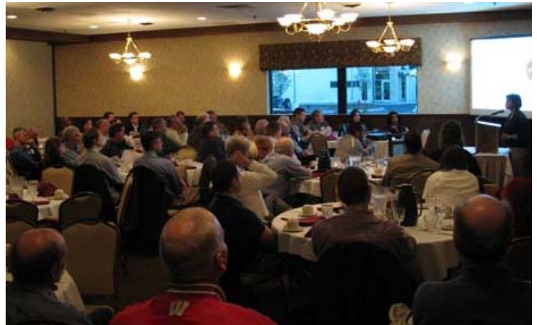
MAY DINNER MEETING

American Society For Quality 600 N. Plankinton Ave., Milwaukee, WI 53203 or sign-in to ASQNet at www.asq.org